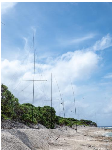
Figure 3. VDAs on shore

Much of Acadia Island is around 10 feet above sea level, with a steep drop off to the shore. The take-off