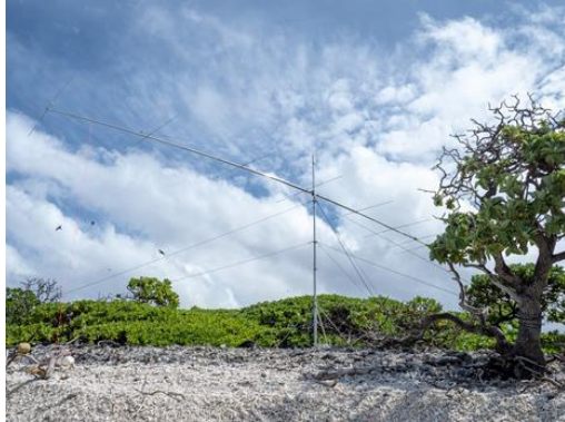
Figure 4. 6m EME Antenna

The EME operation was an interesting venture for us, since there was almost no EME experience within the team. However, we were given guidance by Lance, W7GJ, and by using his loaned EME antenna and “expedition procedure” we were able to make several QSOs on most nights. EME activity was limited to moonrise only because of the location of the antenna, and other competing operating activities.