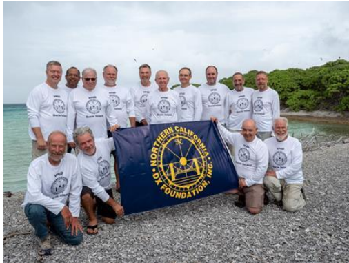
Figure 5. VP6D Team at the Lagoon

We would like to acknowledge the help and support of many groups and individuals who contributed to Ducie 2018. Major early sponsorship from organizations like the Northern California DX Foundation (NCDXF) and the German DX Foundation (GDXF) was important to kick-start our fundraising, and many other clubs and foundations also joined in supporting us. Please review the list of Corporate and Club / Foundation sponsors at VP6D.com, they deserve your support. Over 1,500 individual donors contributed via the VP6D website, including 74 premier donors (contributing over $200) and another 1,700 have