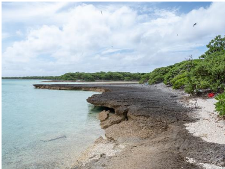
Figure 2. Path to CW Camp

We established two camps, the SSB/Headquarters/main sleeping and eating area on the eastern side of the island and the CW camp just over a kilometer away on Ducie's north coast. There were only a few possible landing sites because a fringing reef surrounds most of the shore, so these determined the locations of the two camps. The separation of about 1 km was adequate to eliminate radio interference between the camps, although the distance between the sites presented some challenges. The ocean shore on Ducie is made of coral rubble which is tiring to walk on, so this was not a good choice for commuting between the two camps. The dense brush made walking directly between the camps